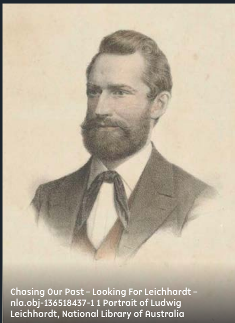
Chasing Our Past – Looking For Leichhardt – nla.obj-136518437-1 1 Portrait of Ludwig Leichhardt, National Library of Australia

Presented by Grandchester Live Model Steam Group