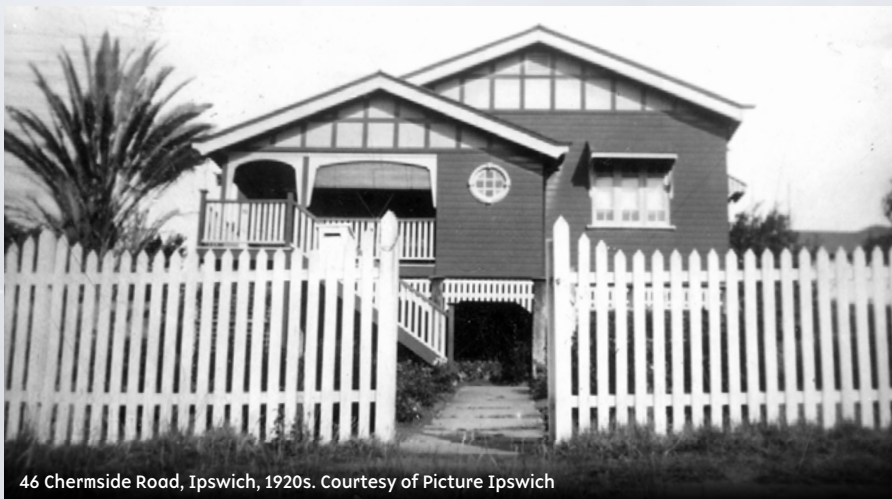
46 Chermerside Road, Ipswich, 1920s.