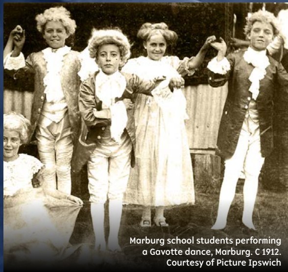
Marburg school students performing a Gavotte dance, Marburg. C 1912.